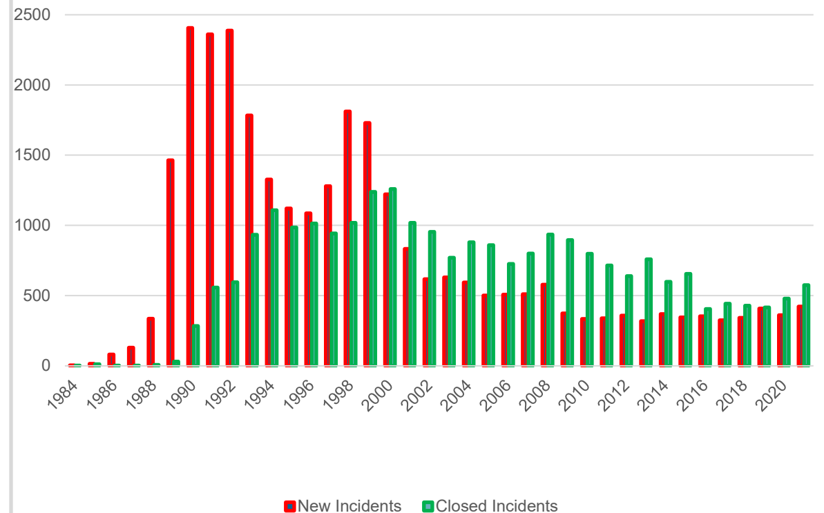
LUST Status Report 1984-2021