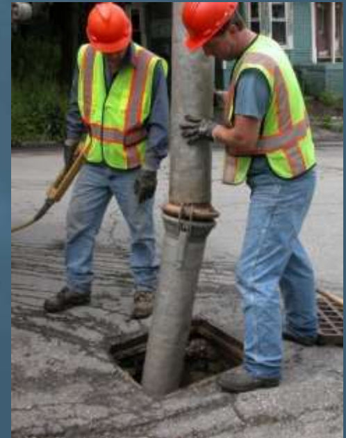
Catch basin cleaning crew, Bangor, 2009