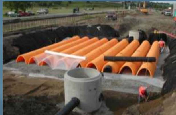
StormTech System, Bangor Waterfront, 2010