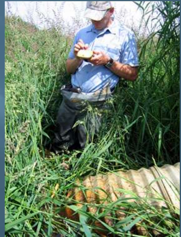
Dry weather outfall inspections, BASWG, 2008