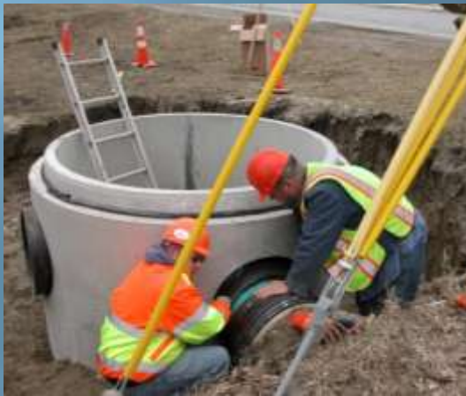
Spill containment, Fleet Maintenance, 2009