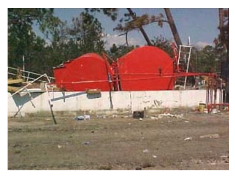
Todd's, Bay St. Louis - These AST's all broken loose from the product lines and rolled over. One of the three tanks is missing from the tank farm.