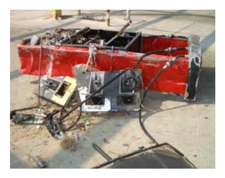
Pantry, Biloxi - The dispenser cabinets were found up to 1/4 mile away.