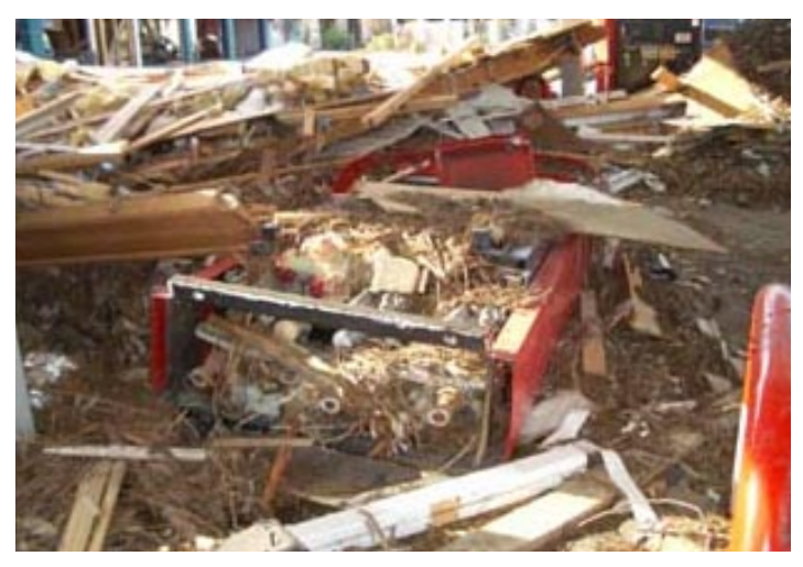
Two Jacks Texaco, Diamondhead - Dispenser cabinet buried amid the debris.