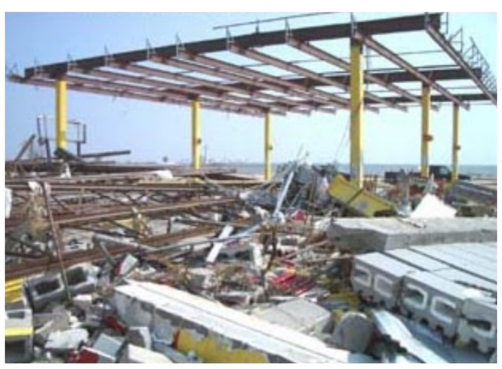
Pantry, Biloxi - Store building completely destroyed by the storm. Broadwater Marina can be seen in the background.