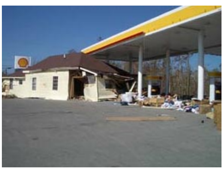
C & J Shell, Pass Christian - This store where a home "floated" up to the dispenser islands is several miles from the coast.