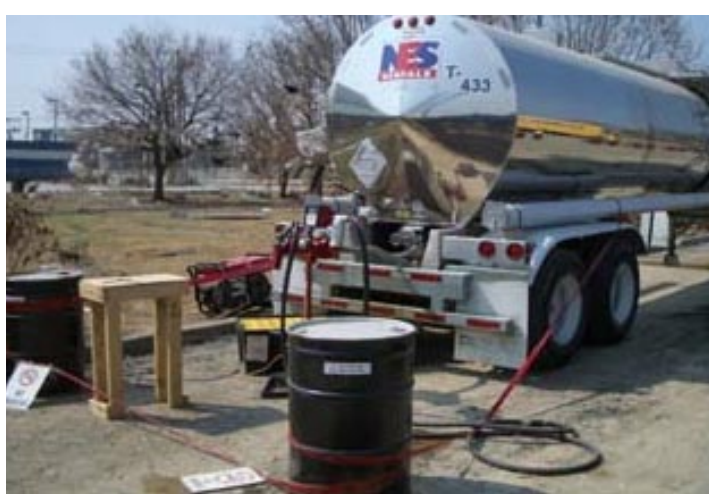
Cadet Marina, Biloxi - Tractor/Trailer tank also utilized for emergency vehicle fueling in the parking lot of the Point Cadet Marina.