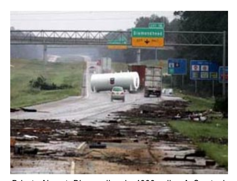
Private Airport, Diamondhead - 4000 gallon AvGas tank tore itself from anchoring and floated down the runway winding up right in the center of I-10 eastbound.