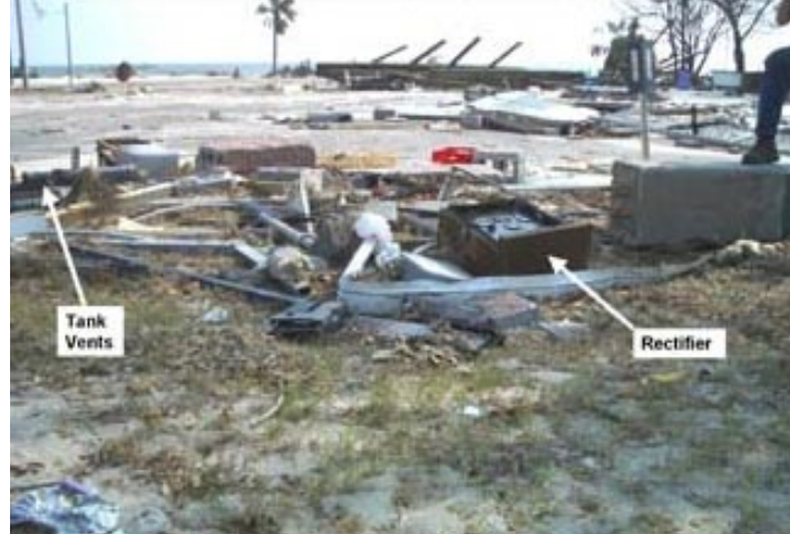
Shell, Gulfport - Impressed current cathodic protection system rectifier remained on site, tethered to anode lead wires.