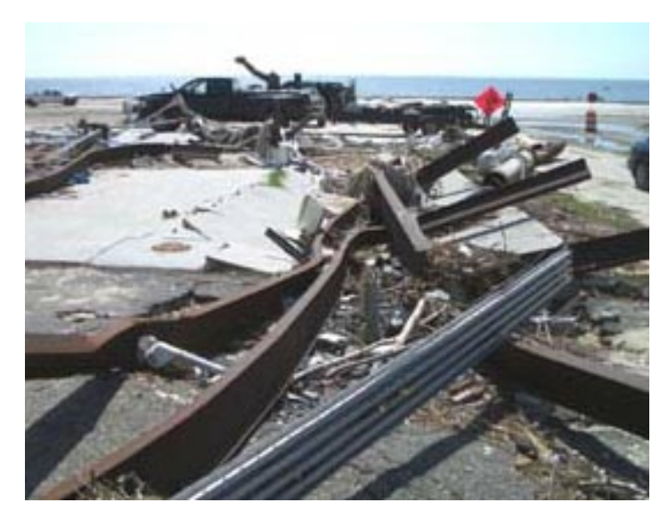
Walco Mart, Gulfport - View of the tank pit showing the "regular unleaded" tank. Apparently, the tank backfill materials were scoured out by the storm surge and the weight of the steel I-beams caused the concrete pad to collapse.