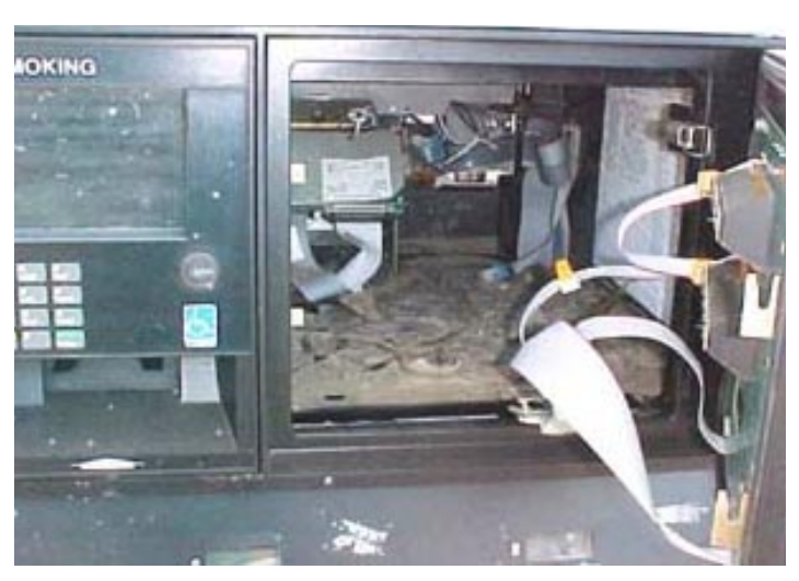
Gas-N-Go, Bay St. Louis - Mud inside brand new dispensers indicates floodwaters ruined all the electronics in these dispensers.