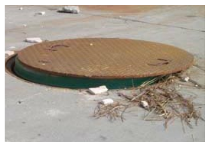
Beau Rivage Marina, Biloxi - "Easy-off" man way lids facilitated by sunken concrete pad.