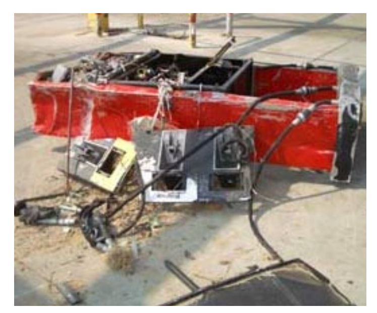
Pantry, Biloxi - The dispenser cabinets were found up to 1/4 mile away.