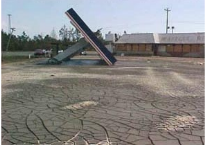
Pure, 13031 Hwy. - Store is 5 miles from the coast. Floodwaters deposited mud and wind knocked canopy down. Tank vent lines were broken when the canopy fell and tanks filled with water. Tank fills are two light spots in foreground.