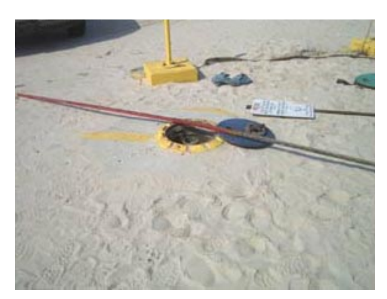
Point Cadet Marina, Biloxi – Gauging the tanks confirmed that floodwater had filled the tanks (note red color of water finding paste on gauging stick).