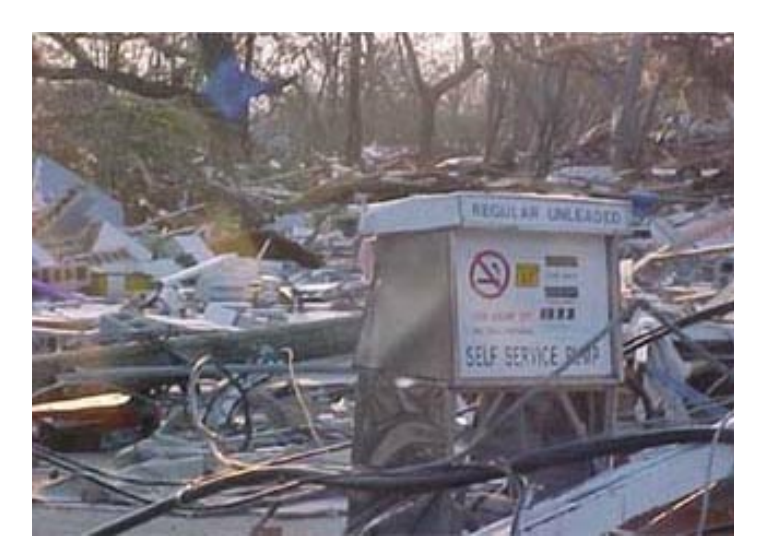
Wavemart, Waveland - Store as it appeared after the storm.