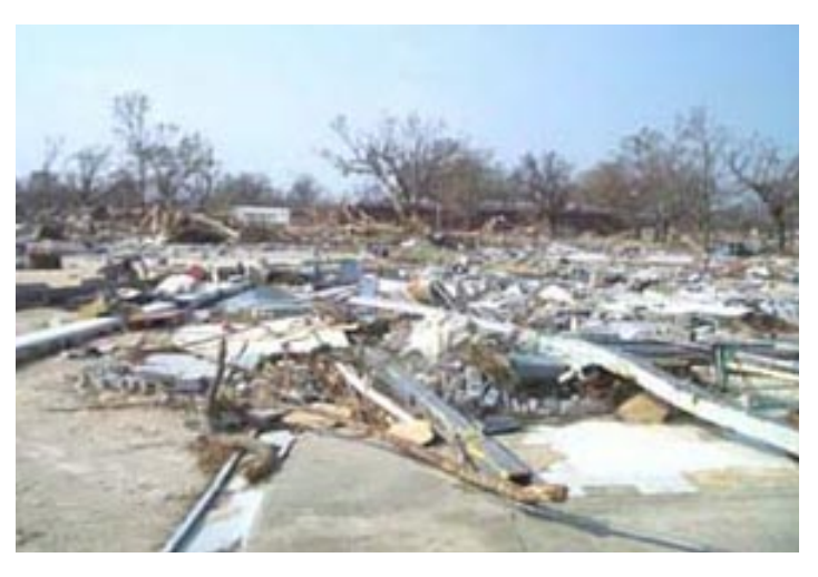
Dixie Gas #10, Gulfport - Store completely demolished by the storm. Note the barge and shipping containers (this store was near the port in Gulfport) in the background that probably contributed to the complete destruction in this area.