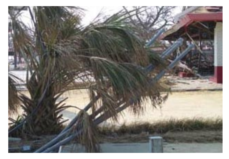
Edgewater Chevron, Gulfport - Store building was completely destroyed but the tank vent lines although badly bent, remained standing. The building to the right in the photo was a McDonald's restaurant immediately adjacent to the Chevron.