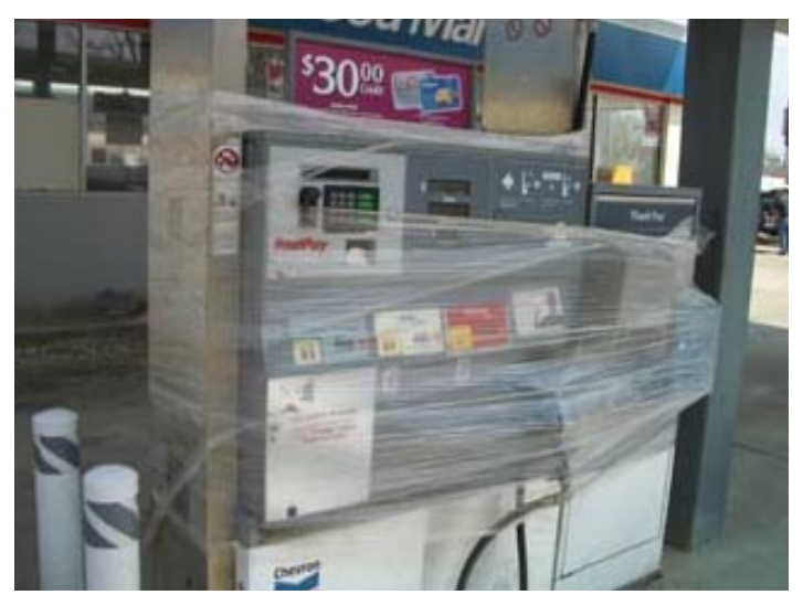
Gas-N-Save Pascagoula - Shrink wrap applied in preparation for the storm was of little use when the store was submerged by 8 feet of flood water.