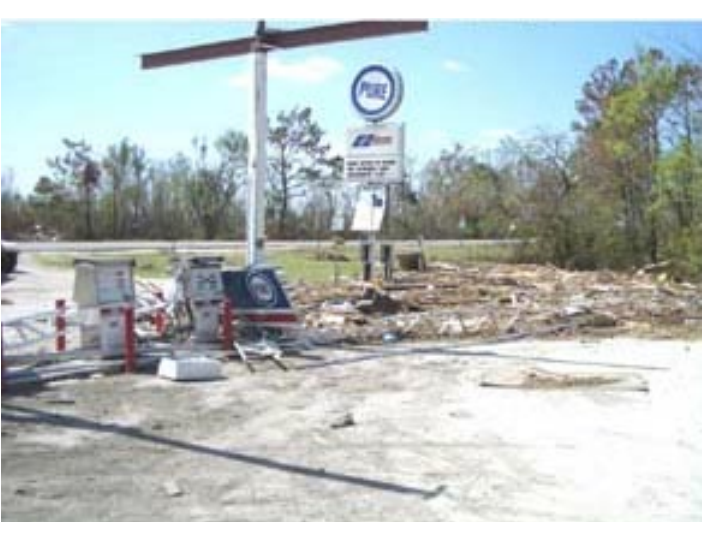
EZ Serve, Pearlington - No access to the tank at this store as they are all underneath the debris and rubble.