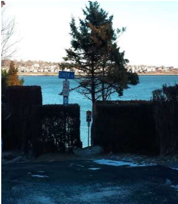
Z-05 Sea View Avenue

Action today so future generations can enjoy ocean activities