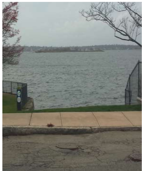
Z-08 Battery Street