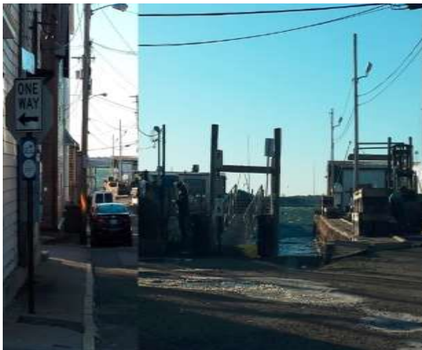
Z-21 Sisson's Wharf