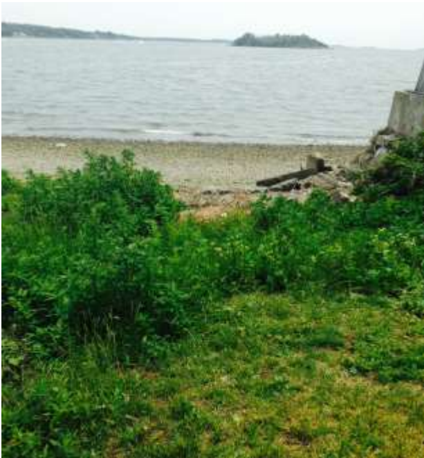
V-07 Seaconnet Blvd. & Ivy Ave.