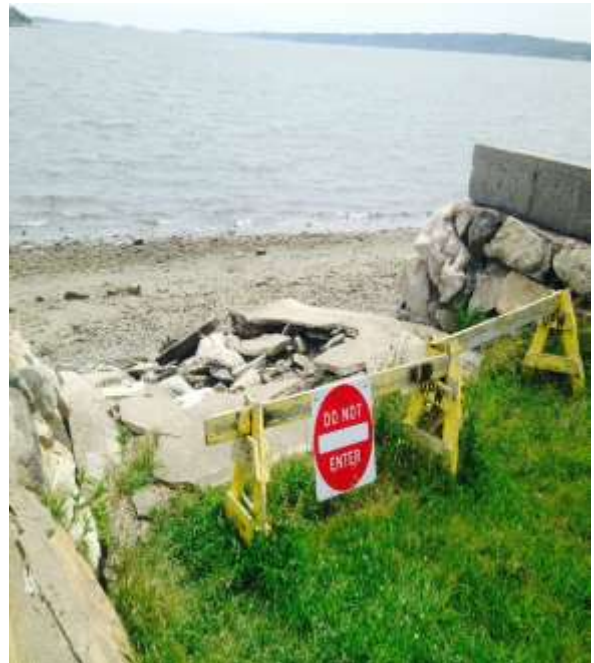
V-08 Seaconnet Blvd.