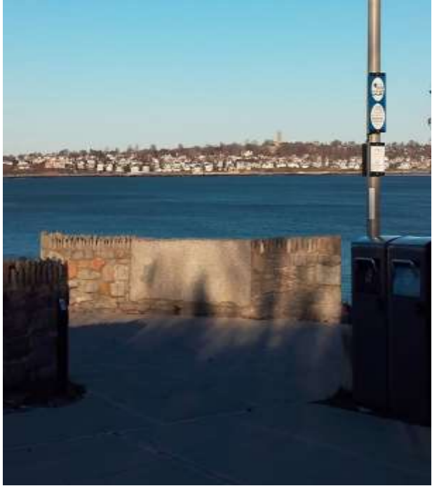
Z-02 Narragansett Avenue