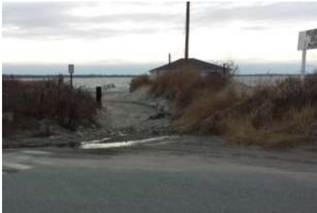
Y-04 Third Beach Road