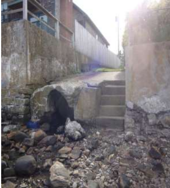
V-13 Aquidneck Avenue

Action today so future generations can enjoy ocean activities