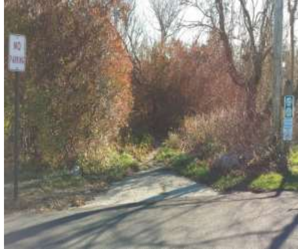
Y-11 Tuckerman East