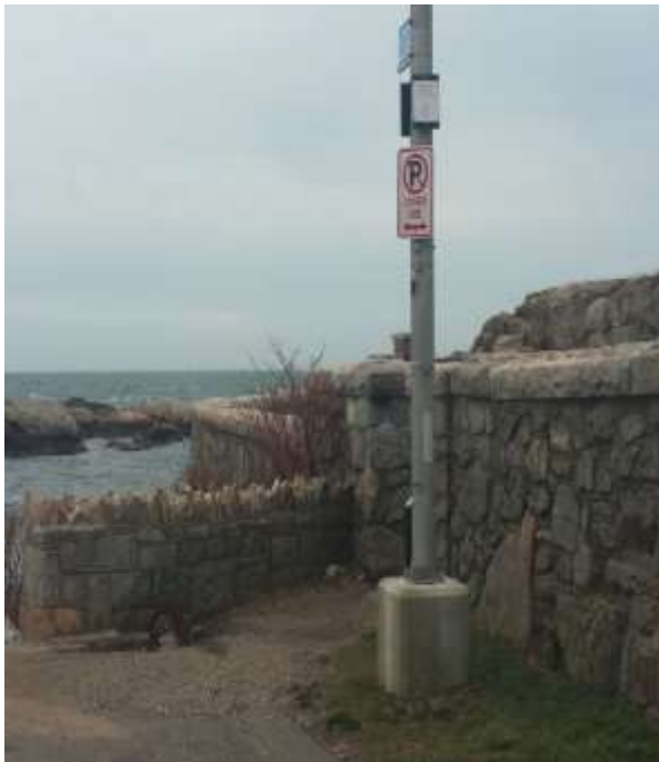
Z-03 Ledge Road