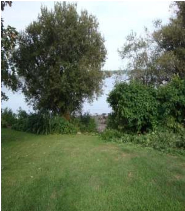
V-15 Atlantic Ave. (easterly end of Tallman Avenue)