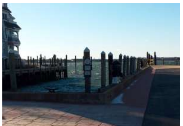
Z-18 Brown & Howard Wharf