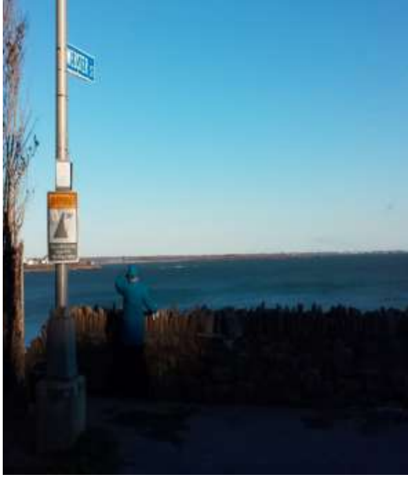
Z-01 Webster Street