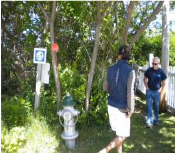
V-01 Mountain View Road