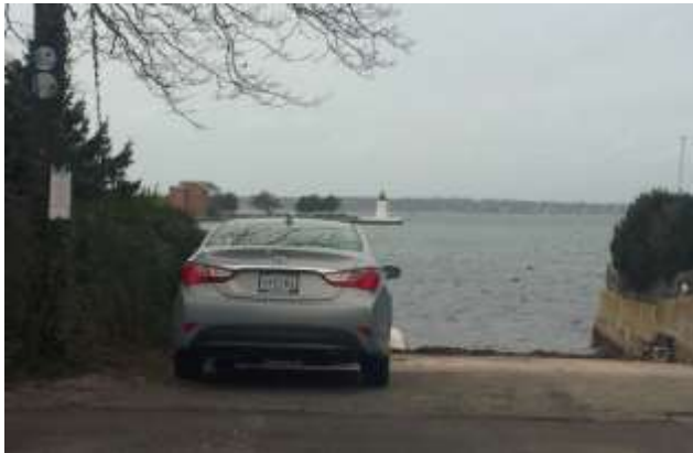
Z-13 Willow Street

Action today so future generations can enjoy ocean activities