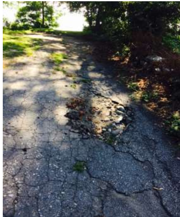
V-16 Child Street