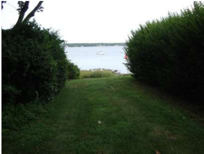
V-17 Morningside Lane

Action today so future generations can enjoy ocean activities