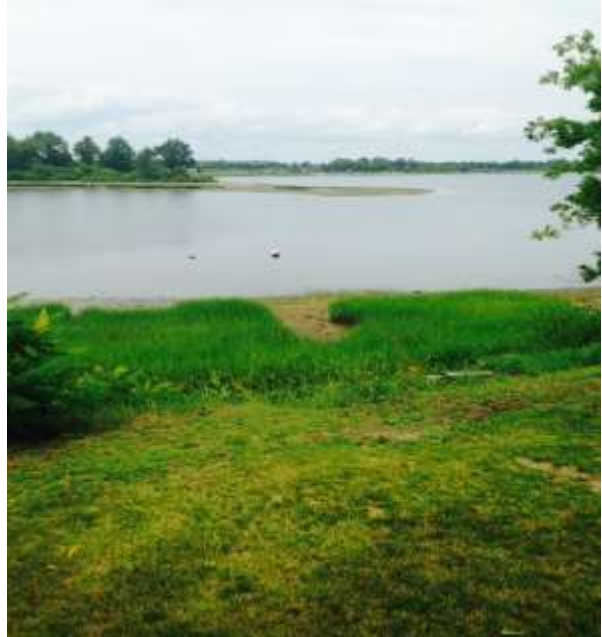
V-06 Green Street