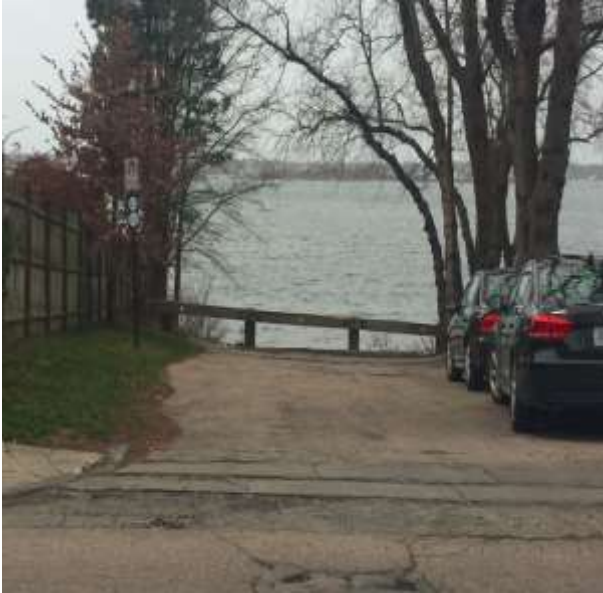
Z-09 Pine Street

Action today so future generations can enjoy ocean activities