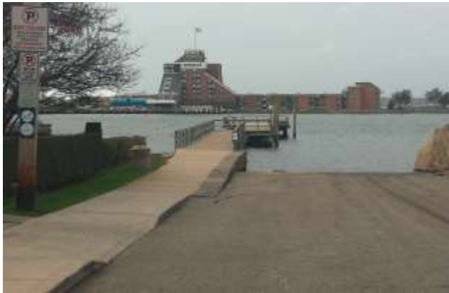
Z-15 Elm Street