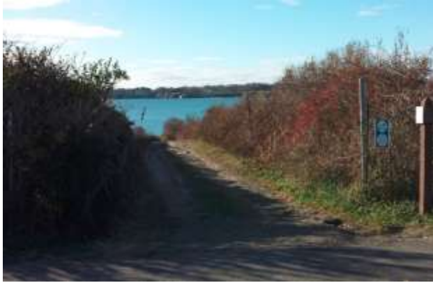
Y-01 Tuckerman West