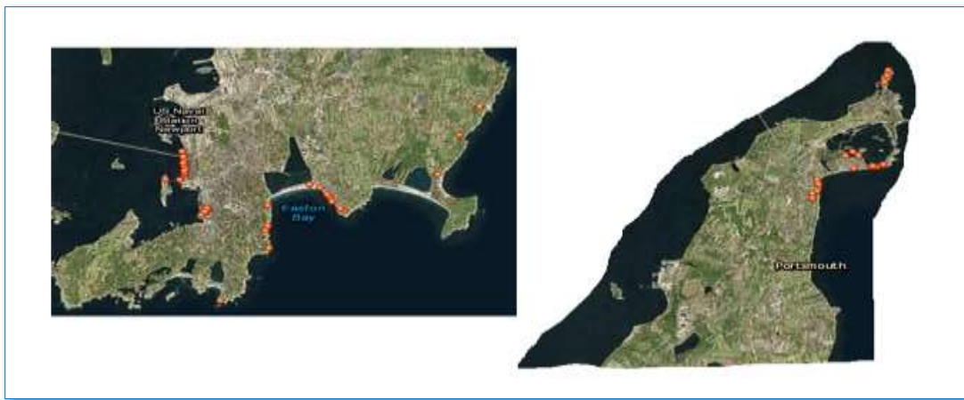
Figure 1: Public rights-of-way on Aquidneck Island (Map courtesy of CRMC).

Clean Ocean Access (COA) requested $4,030 from the Narragansett Bay Estuary Fund to provide strategic assistance to Increase Public Access (protect, preserve and maintain) of the shoreline program (herein referred to as IPAS) into the Newport Harbor, Middletown and Portsmouth and generating significant momentum for adopting the coastline between all access points in the State of Rhode Island. The public rights-of-way and shoreline are shown in figure 1: