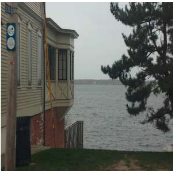
Z-11 Chestnut Street