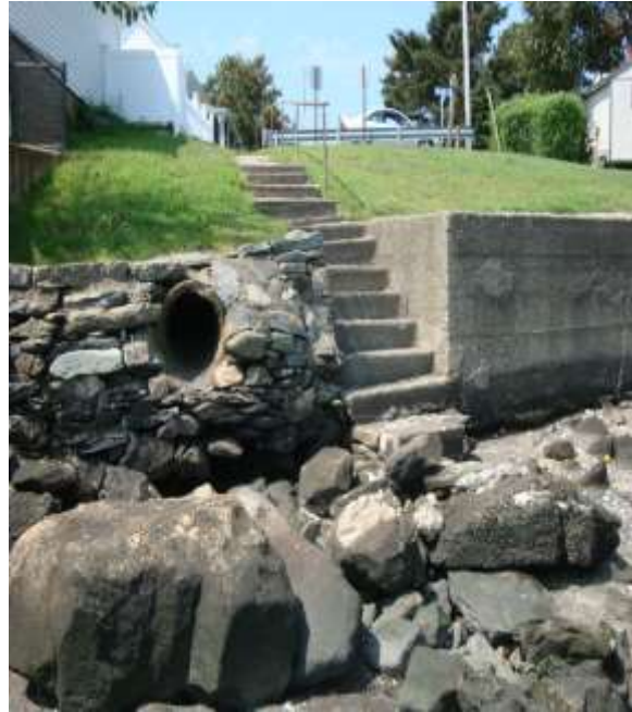
V-14 Atlantic Ave. (easterly end of East Cory's Lane)