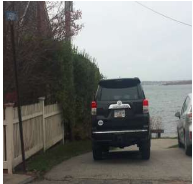
Z-10 Cherry Street