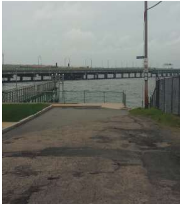
Z-06 Cypress Street