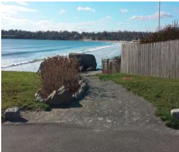
Y-08 Northwest Esplanade