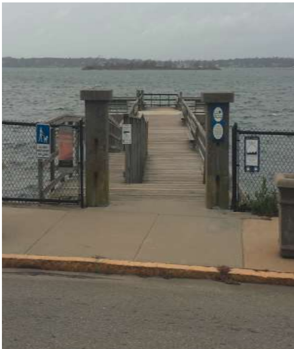
Z-07 Van Zandt Street