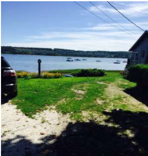
V-03 Narragansett Road