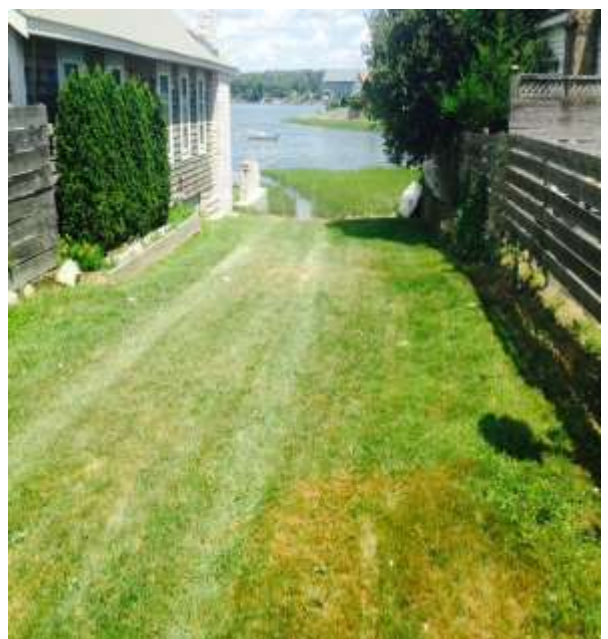
V-04 Cedar Avenue