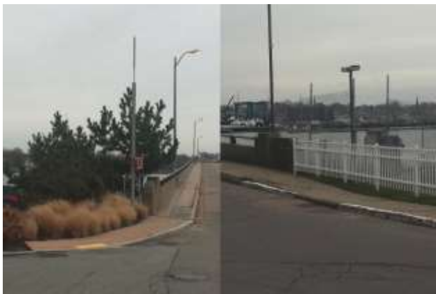
Z-17 Goat Island Connector (28-A West)