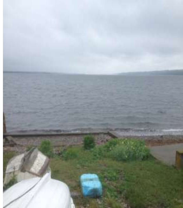
V-12 Fountain Street