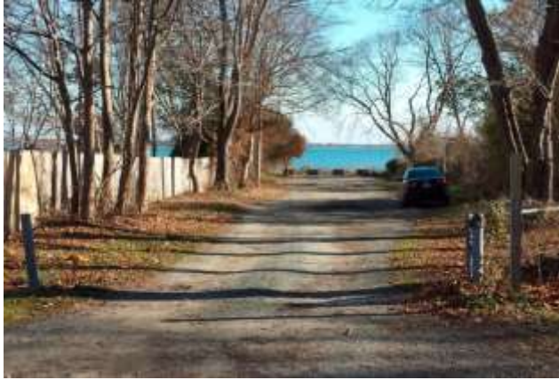
Y-06 Taggarts Ferry Road

Action today so future generations can enjoy ocean activities