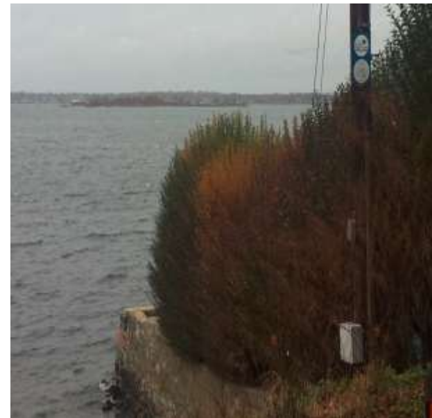
Z-12 Walnut Street