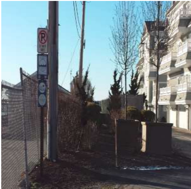
Z-19 Lee's Wharf

Action today so future generations can enjoy ocean activities