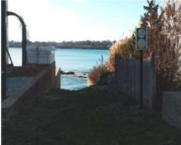
Y-10 Shore Drive (Lot 107)

Action today so future generations can enjoy ocean activities