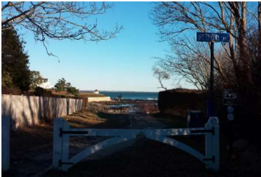
Z-24 Marine Avenue