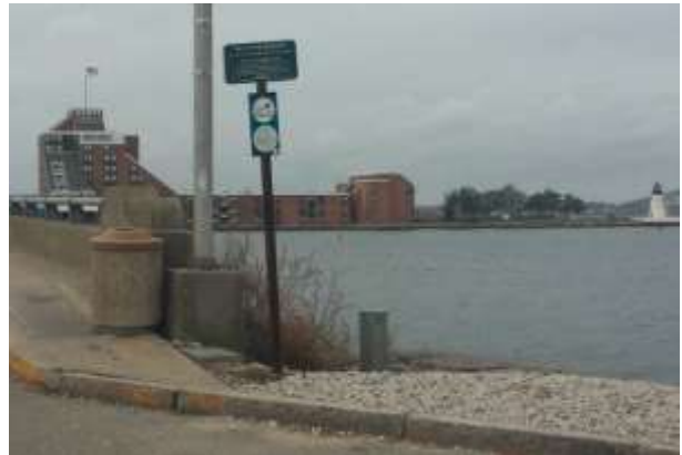
Z-16 Goat Island Connector (28-B East)