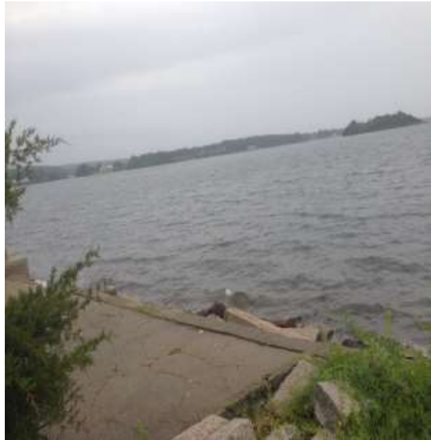
V-10 Seaconnet Blvd. & Island Park Ave.