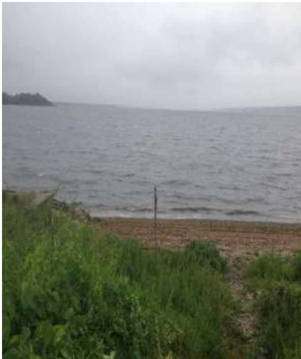
V-11 Ruth Avenue