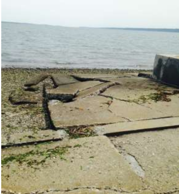
V-09 Seaconnet Blvd. & Gould Ave.

Action today so future generations can enjoy ocean activities