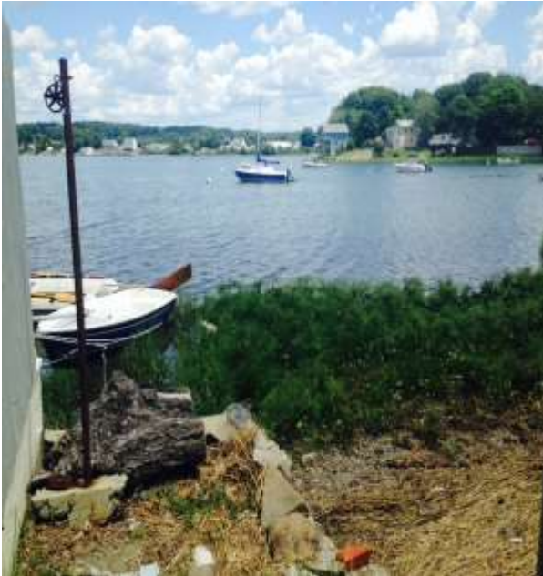
V-05 Point Street

Action today so future generations can enjoy ocean activities