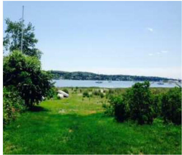
V-02 Anthony Road