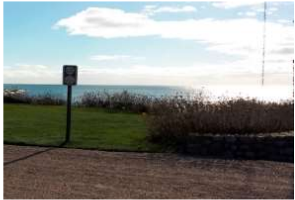
Y-03 Shore Drive