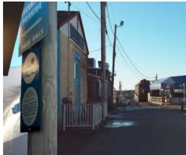
Z-22 Waites Wharf