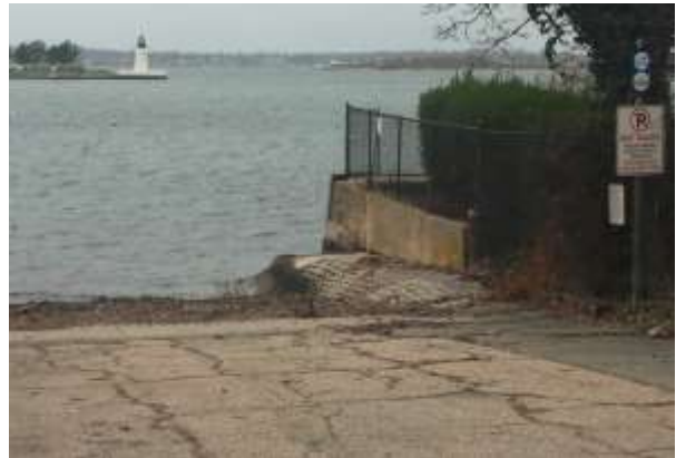
Z-14 Poplar Street