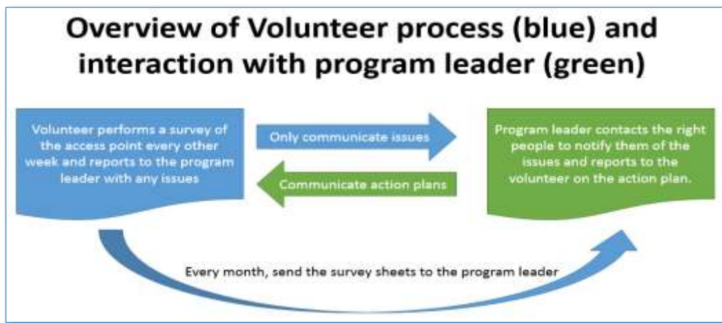
Figure 2: Monitoring public rights-of-way.

Our innovative approach begins with a solutions architecture for increasing public access to the shoreline and splits all activities into loosely coupled decentralized activities that allows for anyone in the community to participate and actively contribute to making Rhode Island a better place to live, visit and work. Our approach towards community involvement is to create some small manageable activities that are fun, easy, impactful, rewarding, and provide a clear connection to the overall mission of the program. This is achieved by a four-step method which may occur concurrently or sequentially. Step 1 is the formal adoption of the public rights-of-way via the MOU that requires interacting with local municipalities (administration and council), CRMC staff and adopting entity. Step 2 is the monitoring (initially ad-hoc and then formally via the MOU) that involves a volunteer performing a site inspection twice monthly reporting on conditions of the access point as shown in figure 2. Step 3 is providing quarterly reports to the local municipalities, and CRMC. Step 4 happens from the inception of the program and is to promote long-lasting stewardship of public access (protect, preserve and maintain) to the shoreline.