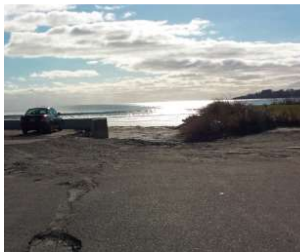
Y-09 West End Purgatory Road