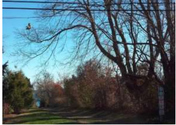
Y-07 Kingfisher Avenue