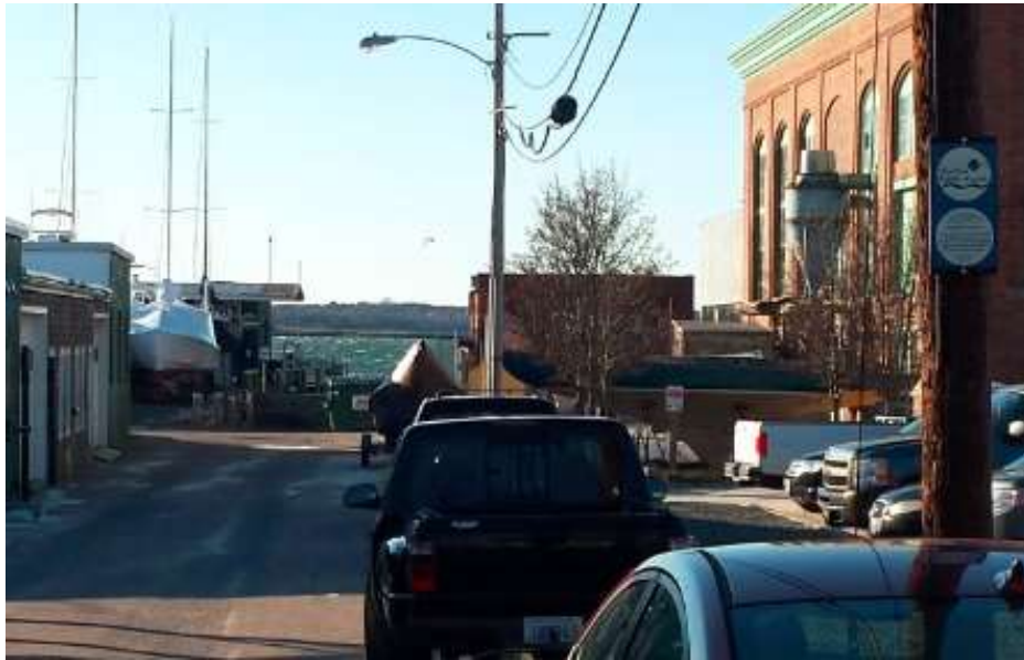
Z-23 Spring Wharf

Action today so future generations can enjoy ocean activities