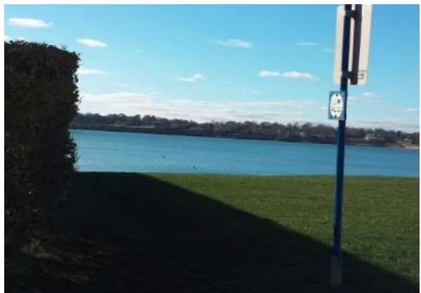
Y-05 South East Esplanade