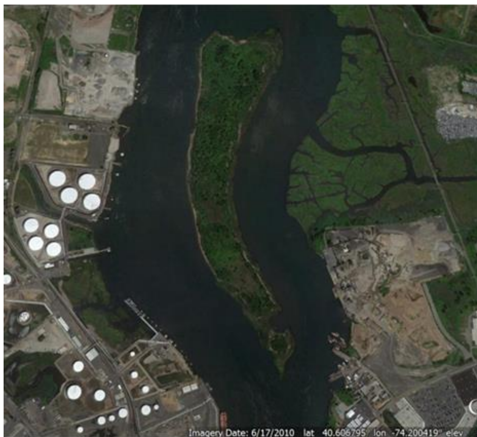
Figure 1. Map of Prall's Island. Google Earth image from 2010. Prall's Island is situated in the Arthur Kill, between Linden New Jersey and Staten Island, New York.