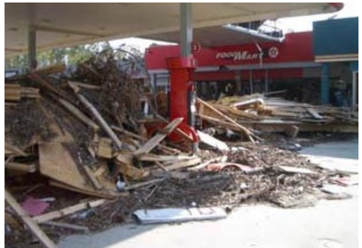
Two Jacks Texaco, Diamondhead - Huge pile of debris left at the dispenser islands of this store.