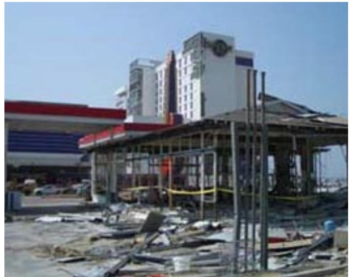
Fast Trac - Store building was blown out by storm surge. Hard Rock Casino in background was to have its grand opening the day after the storm hit.