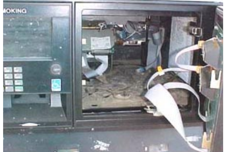
Gas-N-Go, Bay St. Louis - Mud inside brand new dispensers indicates floodwaters ruined all the electronics in these dispensers.