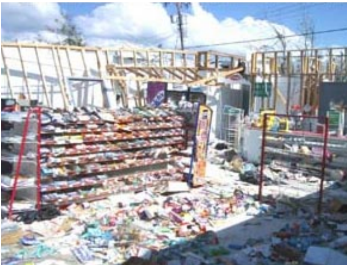
Ben's Chevron, Long Beach - This store was several miles from the coast and no flood waters reached it. This damage was caused by the 120+ mph winds.