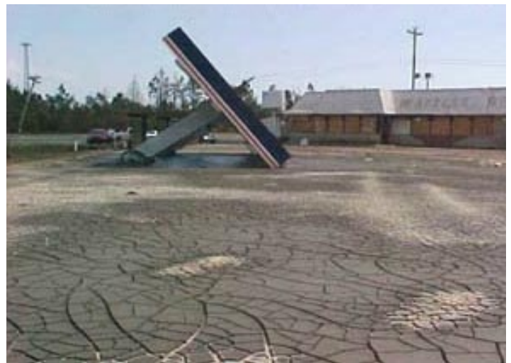
Pure, 13031 Hwy. - Store is 5 miles from the coast. Floodwaters deposited mud and wind knocked canopy down. Tank vent lines were broken when the canopy fell and tanks filled with water. Tank fills are two light spots in foreground.