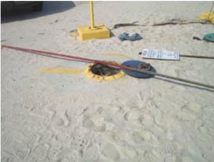
Point Cadet Marina, Biloxi – Gauging the tanks confirmed that floodwater had filled the tanks (note red color of water finding paste on gauging stick).