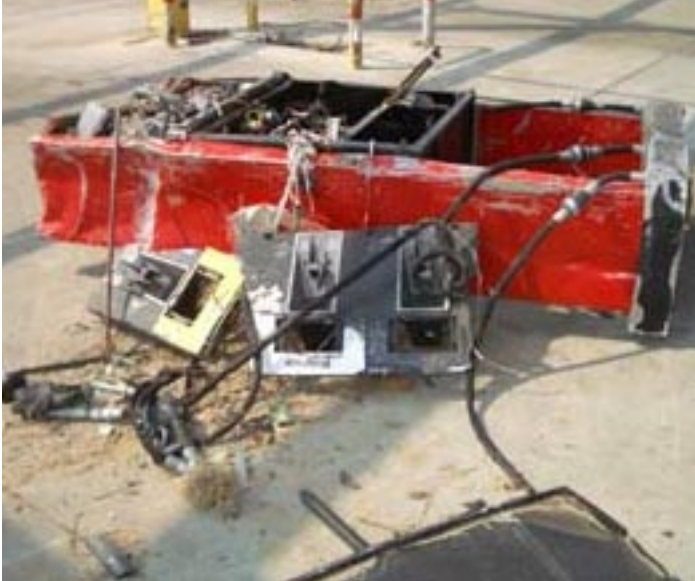
Pantry, Biloxi - The dispenser cabinets were found up to 1/4 mile away.