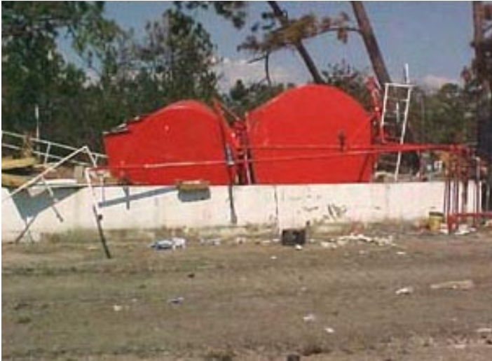
Todd's, Bay St. Louis - These AST's all broken loose from the product lines and rolled over. One of the three tanks is missing from the tank farm.