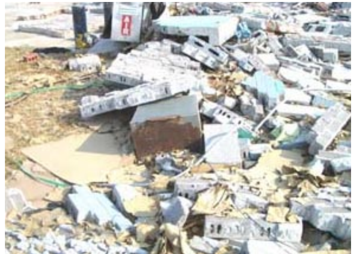
Dixie Gas, Gulfport - Cathodic protection system rectifier (face down) and air compressor were about the only things recognizable at this store.