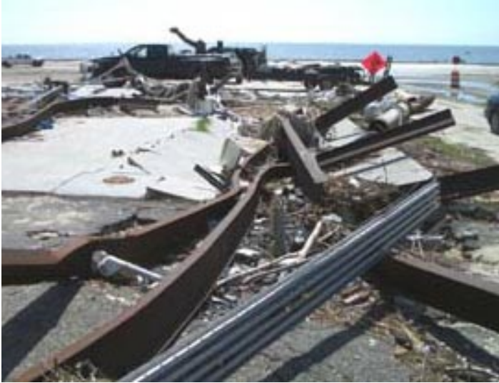
Walco Mart, Gulfport - View of the tank pit showing the "regular unleaded" tank. Apparently, the tank backfill materials were scoured out by the storm surge and the weight of the steel I-beams caused the concrete pad to collapse.