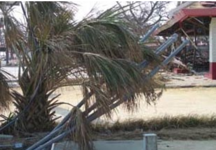
Edgewater Chevron, Gulfport - Store building was completely destroyed but the tank vent lines although badly bent, remained standing. The building to the right in the photo was a McDonald's restaurant immediately adjacent to the Chevron.