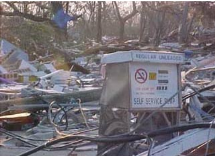
Wavemart, Waveland - Store as it appeared after the storm.