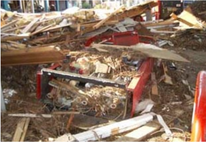
Two Jacks Texaco, Diamondhead - Dispenser cabinet buried amid the debris.