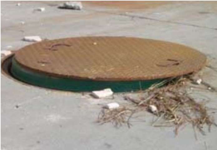
Beau Rivage Marina, Biloxi - "Easy-off" man way lids facilitated by sunken concrete pad.