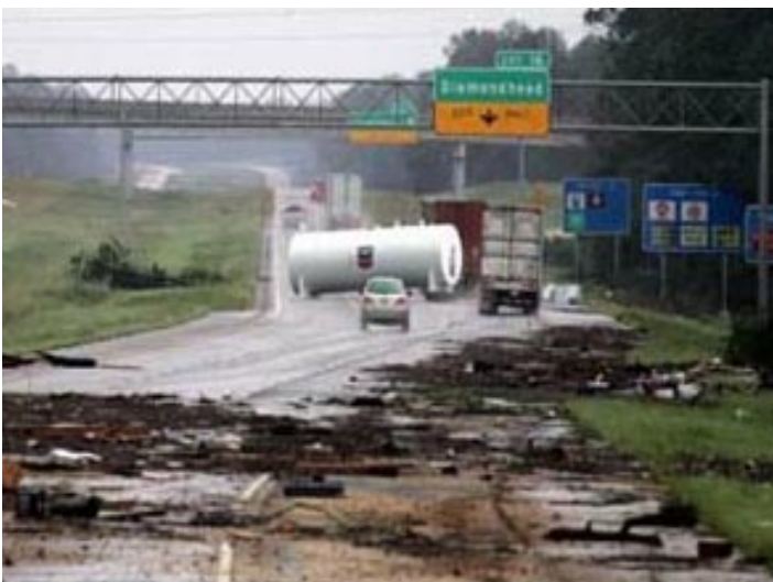
Private Airport, Diamondhead - 4000 gallon AvGas tank tore itself from anchoring and floated down the runway winding up right in the center of I-10 eastbound.