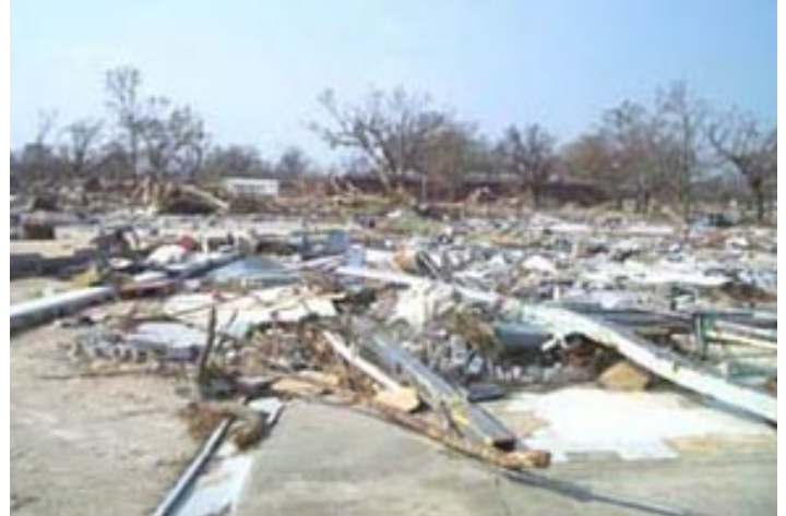
Dixie Gas #10, Gulfport - Store completely demolished by the storm. Note the barge and shipping containers (this store was near the port in Gulfport) in the background that probably contributed to the complete destruction in this area.