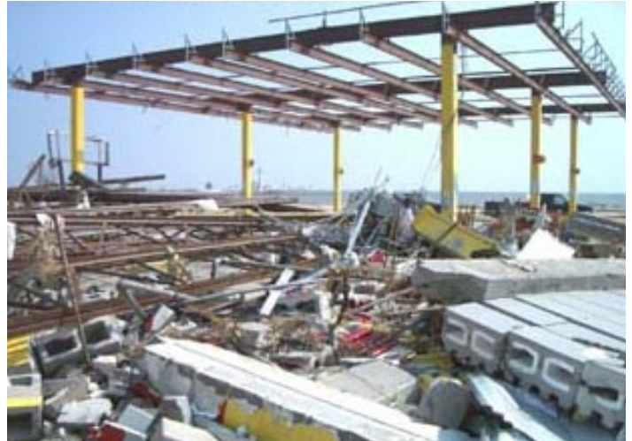
Pantry, Biloxi - Store building completely destroyed by the storm. Broadwater Marina can be seen in the background.