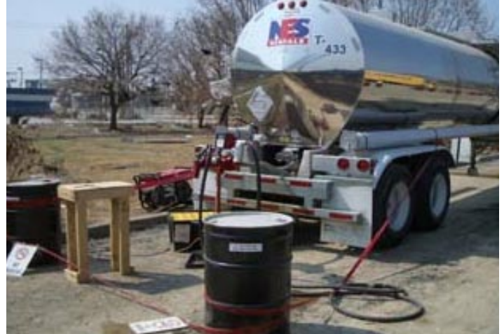
Cadet Marina, Biloxi - Tractor/Trailer tank also utilized for emergency vehicle fueling in the parking lot of the Point Cadet Marina.