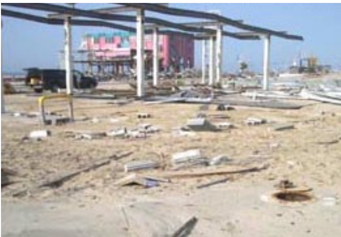
P & L Quick Mart, Biloxi - Store after the storm. Only one tank could be accessed here due to the sand/debris covering the parking lot.