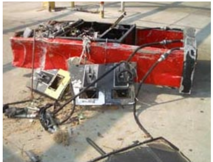
Pantry, Biloxi - The dispenser cabinets were found up to 1/4 mile away.