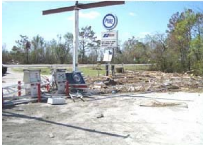
EZ Serve, Pearlinton - No access to the tank at this store as they are all underneath the debris and rubble.