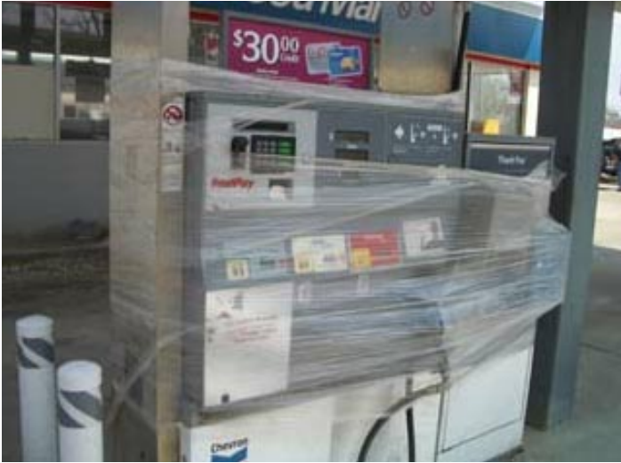
Gas-N-Save Pascagoula - Shrink wrap applied in preparation for the storm was of little use when the store was submerged by 8 feet of flood water.