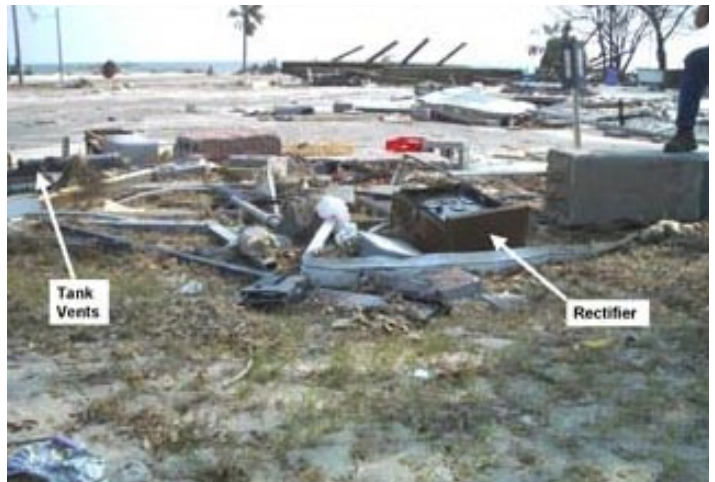
Shell, Gulfport - Impressed current cathodic protection system rectifier remained on site, tethered to anode lead wires.