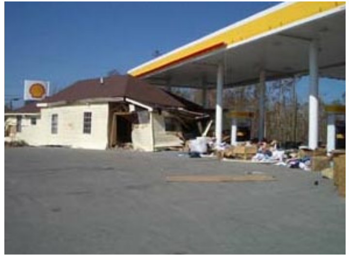
C & J Shell, Pass Christian - This store where a home "floated" up to the dispenser islands is several miles from the coast.