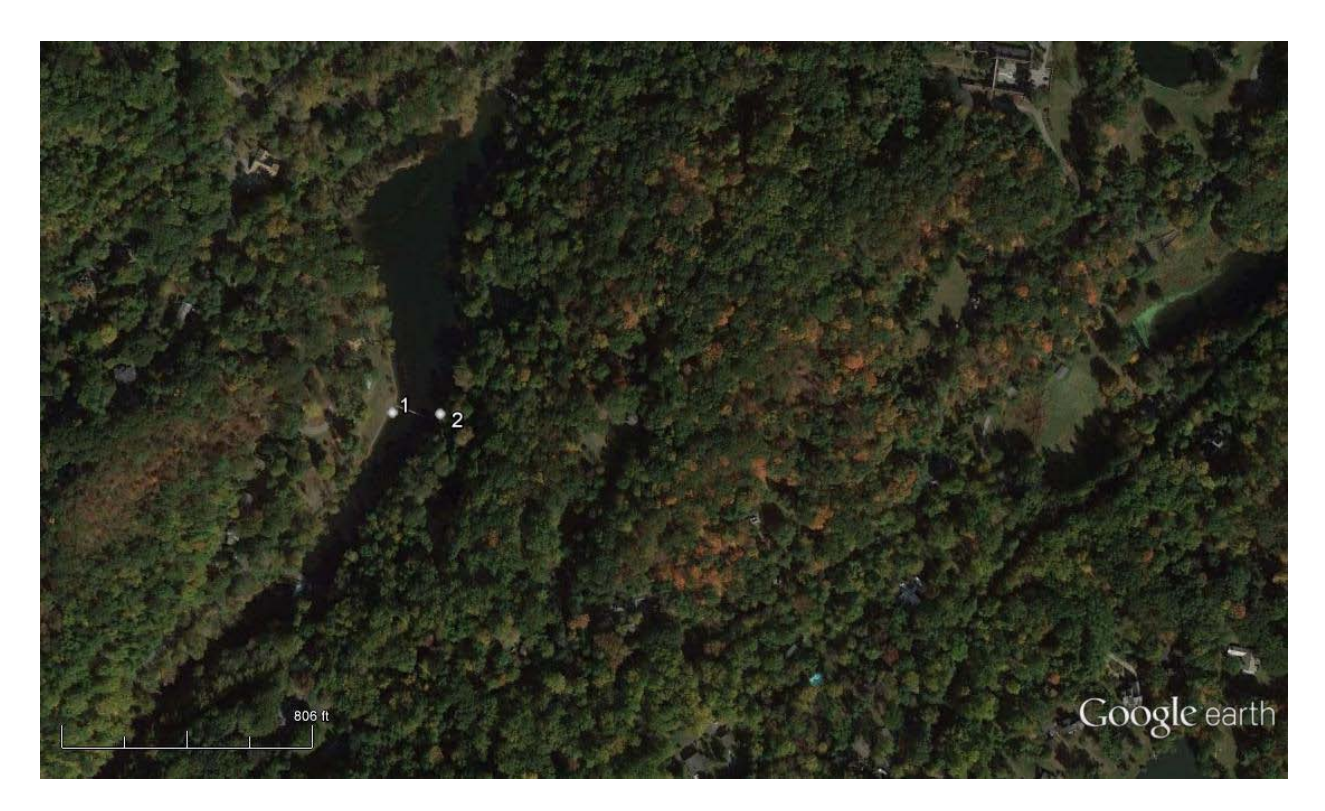
Figure 1. Black Rock State Park Tuber Sampling Sites.

A good baseline and yearly tracking of densities can aid in planning the management needed to achieve either eradication where feasible or strong maintenance control that would improve habitat and reduce risk of further spread within the watershed or other regional sites within the adjacent Hudson River. Future tuber sampling in the lower Croton River should also be timed for mid-tide (or when water clarity is favorable) to improve visual location of dense hydrilla and assisting navigation to monitored locations. Also, final planning of future tuber survey efforts should ideally immediately follow a recent mid-late summer vegetation survey to help locate potential new sampling sites.