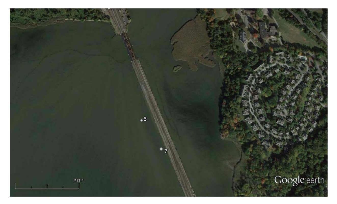
Figure 3. Upper Croton Bay Tuber Sampling Sites.