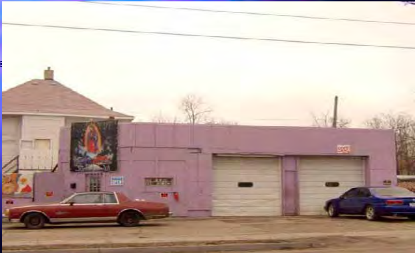
STEVEN BOYT PROPERTY, 2208 FOREST