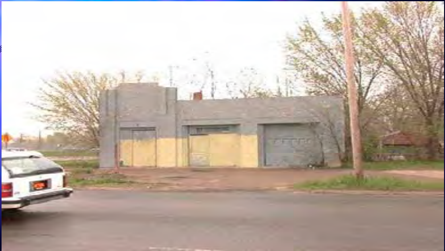
DES MOINES IND SCHOOL DISTRICT, 1820 FOREST