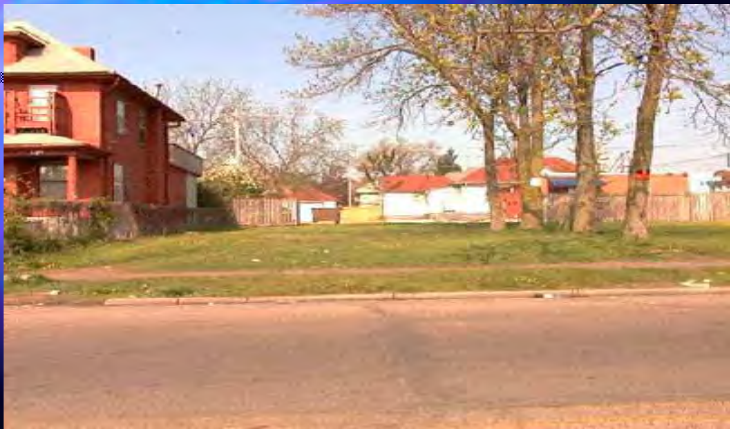
POLK COUNTY PROPERTY, 1374 21ST STREET