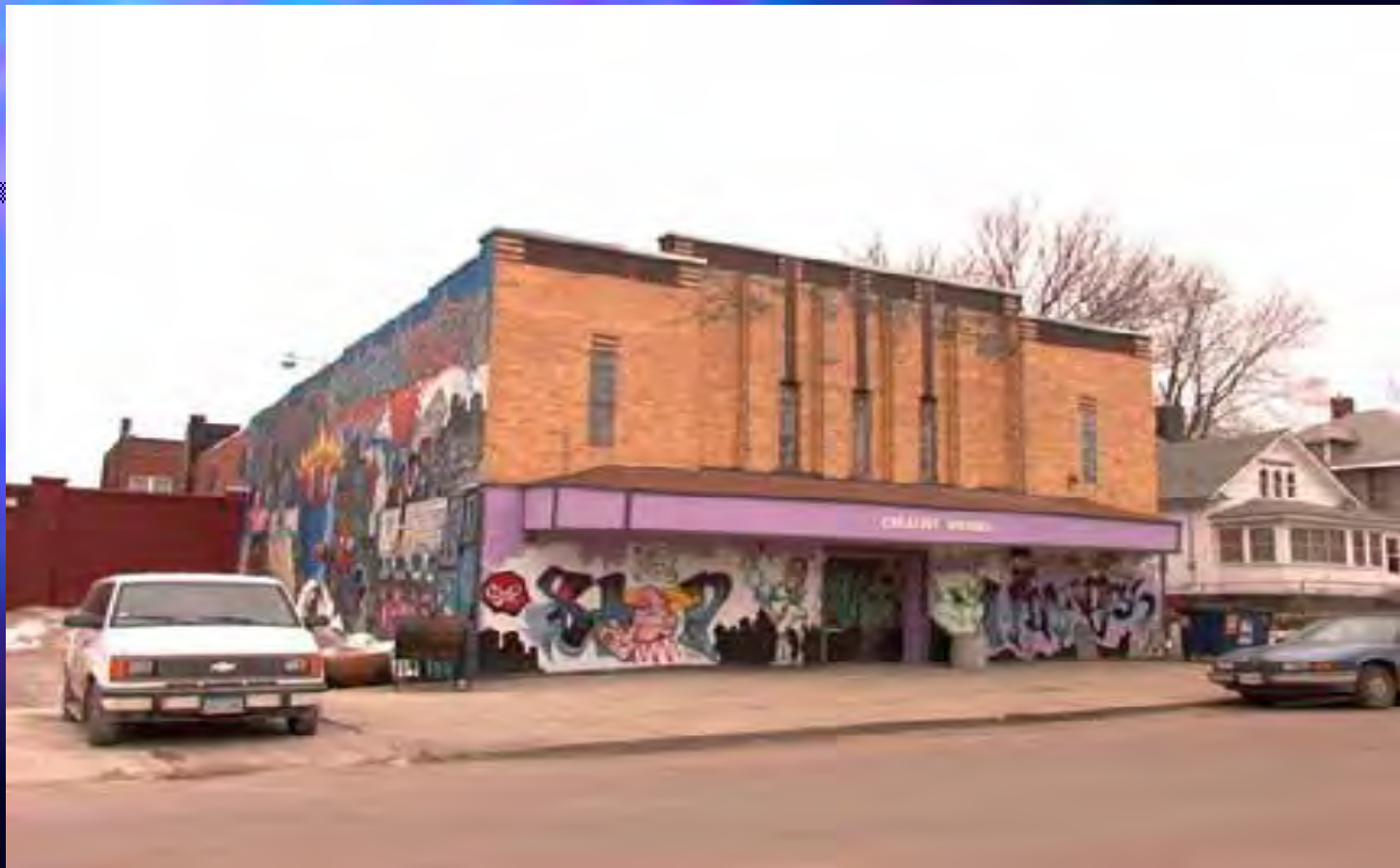
CREATIVE VISIONS, 1343 13TH STREET