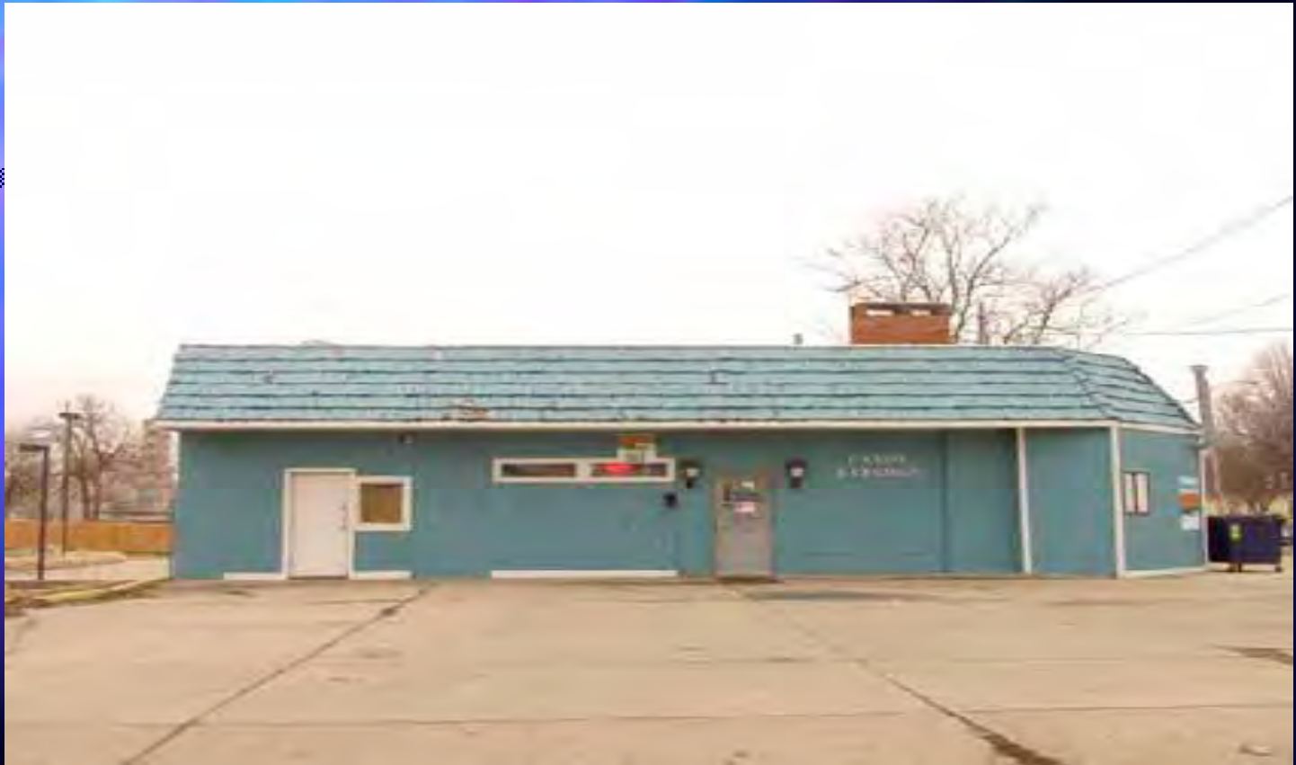
CANDY KITCHEN, 2024 FOREST