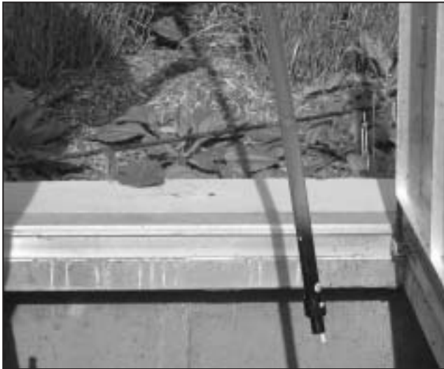
A sludge judge can be used to collect sludge samples.

Composite Liquid Sludge Sampler: A composite liquid sludge sampler or “coliwasa” can be used to collect flowable sludge from a lagoon, tank, or other sludge containment areas. A “core” or depth profile can be collected with this device. The coliwasa is typically a 5-foot long (longer versions are commercially available) tube fabricated from metal, glass, or plastic. The bottom is fitted with a mechanism that can be opened and closed to collect a sample when the coliwasa is lowered into liquid sludge. To use the device, the bottom is opened and slowly lowered into the sludge. Once the intended depth is reached, the bottom of the coliwasa is closed and the sample is collected. The sample collected is a composite of the sludge profile at that point. A “sludge judge” is a similar device that is typically used to measure the depth of the sludge blanket in a lagoon or tank. However, after measuring the depth of the blanket, a sample of sludge can be collected for analysis.