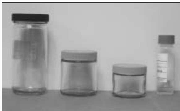
Glass wide-mouth jars are commonly used for sludge samples.

The cleaning procedure for sampling equipment is also applicable to sampling containers. The cleaning protocol should be tailored to meet the data quality objectives for the subject analysis. A quality control assessment of the cleaning procedure should be performed. This can be accomplished by storing deionized water in previously cleaned container and analyzing the water from the container during a subsequent round of testing.