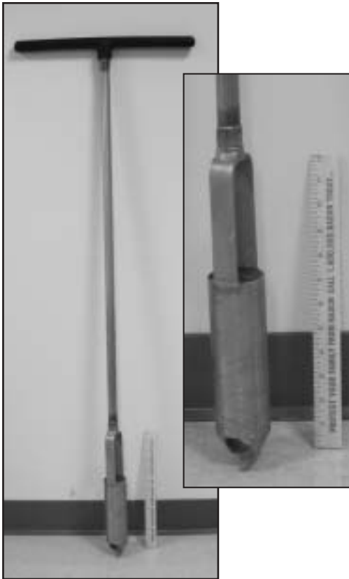
Soil Auger, note drill-like cutters

used in a similar manner. The trier is comprised of a single metal tube, generally stainless steel or brass, which has been cut in half along its length. The end of the tube is sharpened to allow the trier to be more easily pushed into the material being sampled. Commercially available probes for soil sampling have a similar construction and can be used for the same purpose.