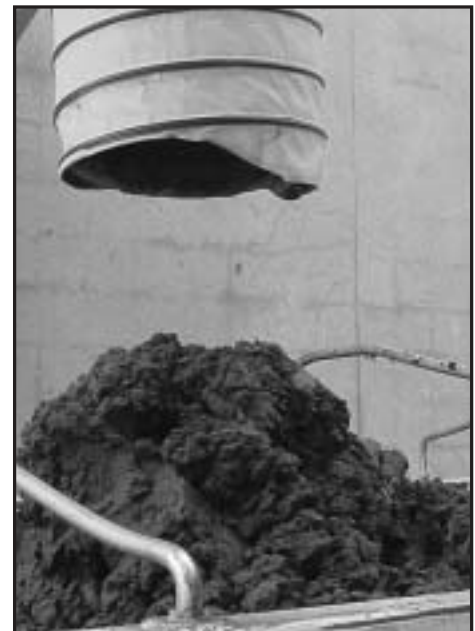
Sludge consistency can vary from a low percent solids (L) to a high percent solids (R).