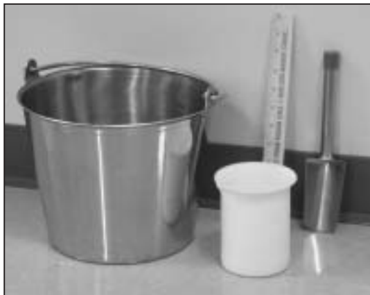
Other commonly-used sampling tools

Other Equipment: The tools described above are employed for the actual collection of sludge samples. However, a variety of other items are needed for sampling biosolids. Table 7-1 provides a list of typical sludge sampling equipment.