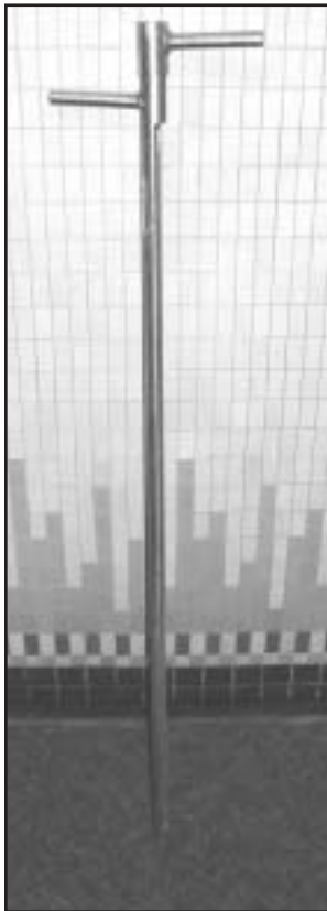
Missouri D Probe